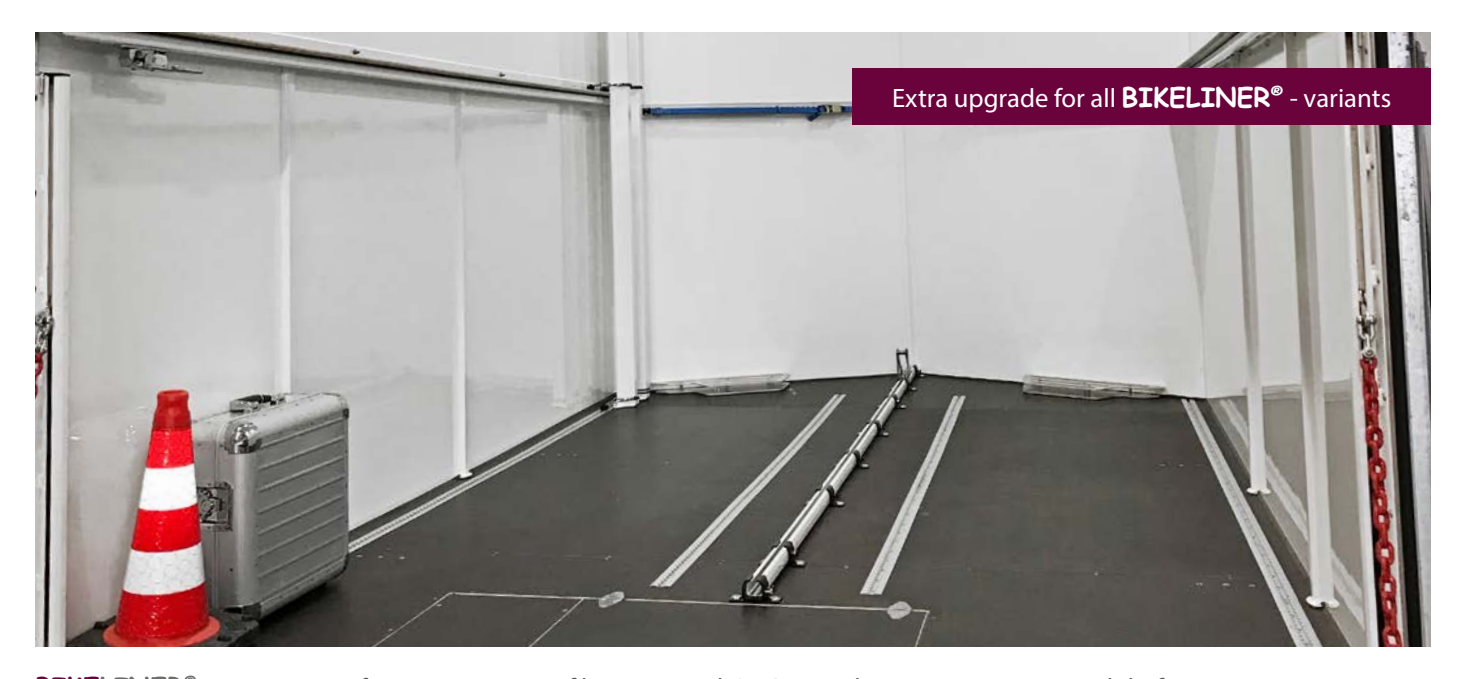
BIKELINER® Luggage Line for up to 2.5 tons of luggage, incl. BAG-compliant cargo security and theft protection