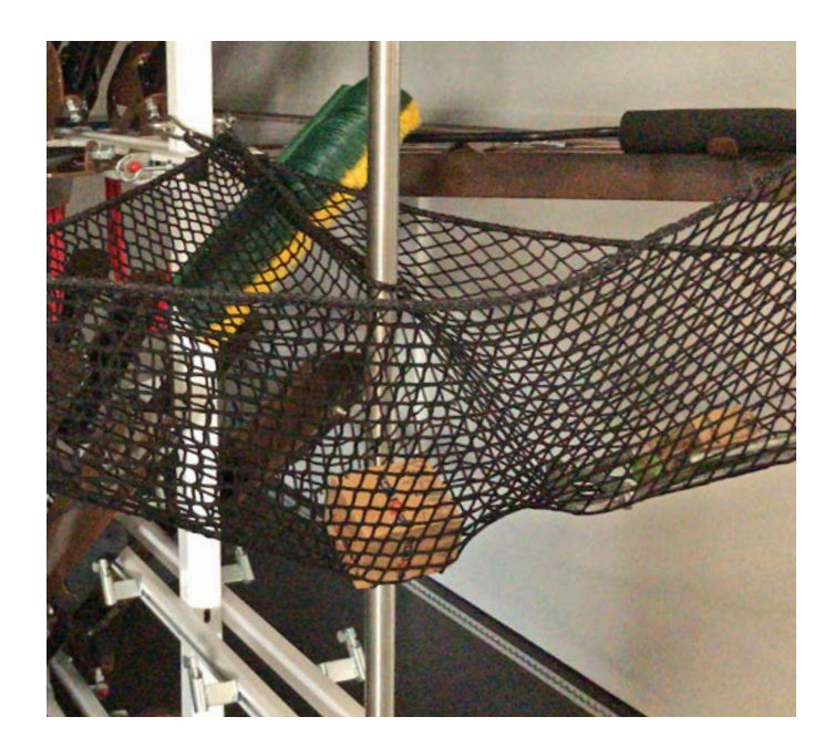
NEW: Triangular cargo net for transporting helmets