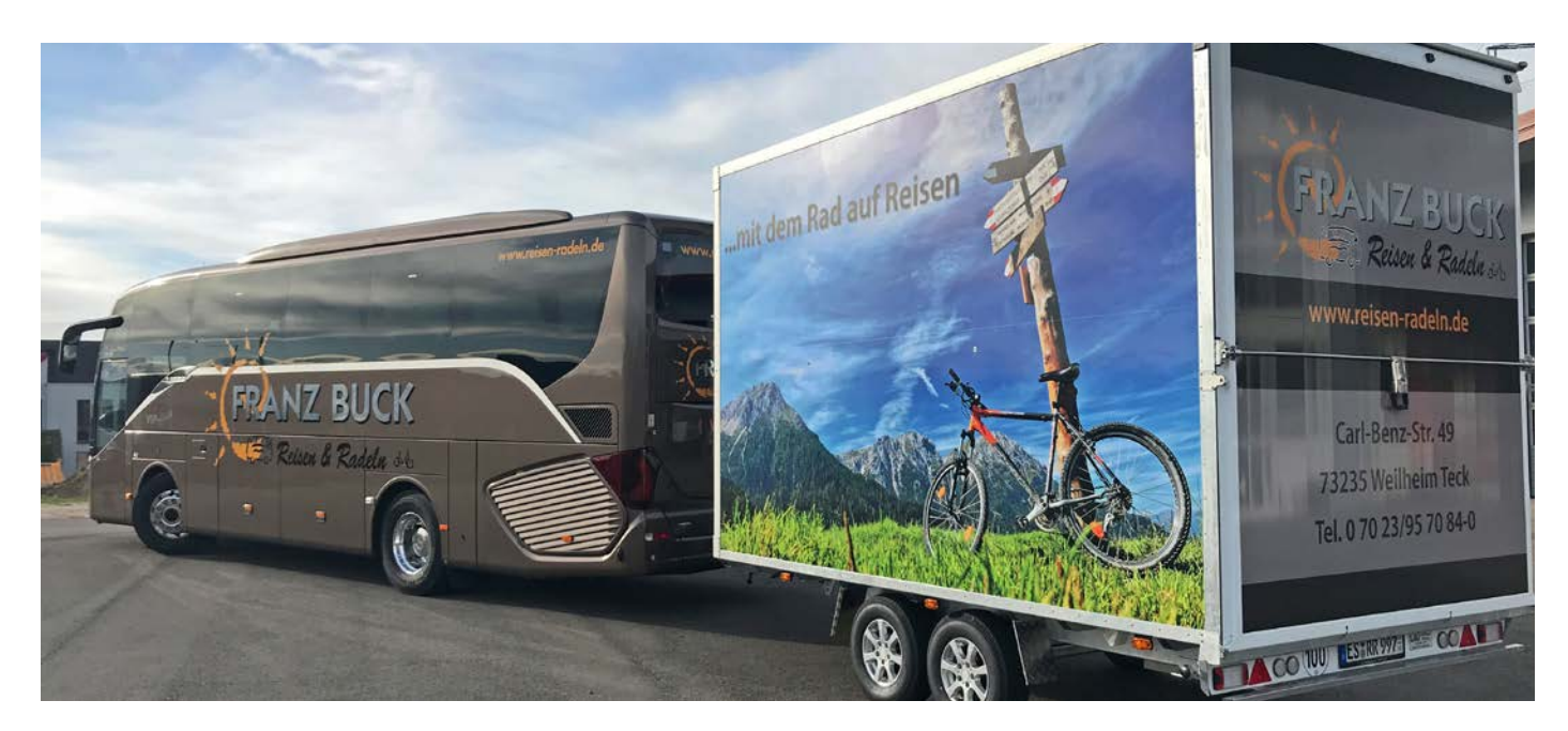
BIKELINER® Professional for up to 48 bicycles