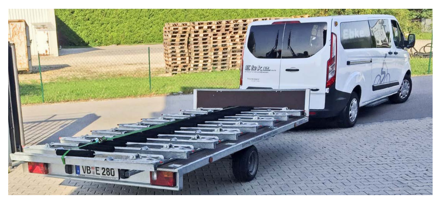
BIKELINER® Private Line for 2 -10 bicycles, ideal for collecting bicycles or for family trips