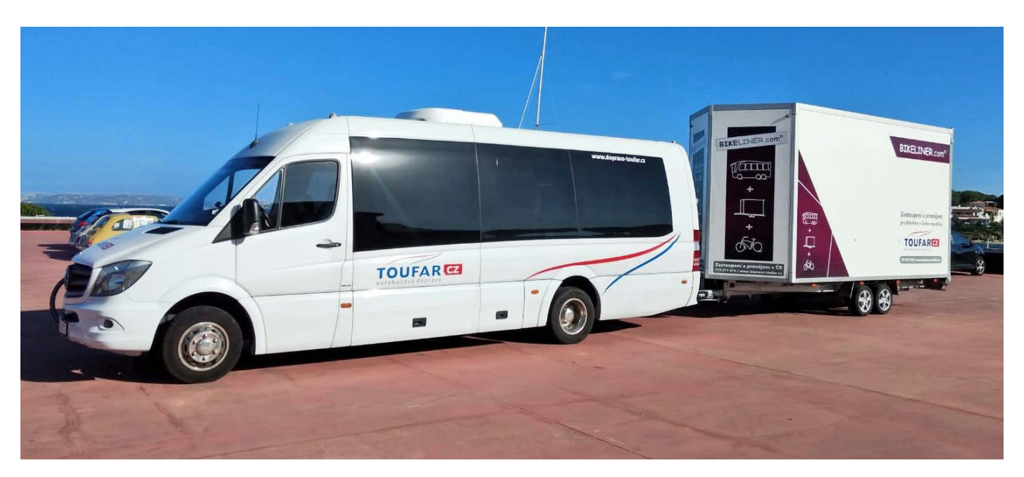
BIKELINER® Club Line for 8 - 23 bicycles, usable for vehicles with 2.5t trailer load