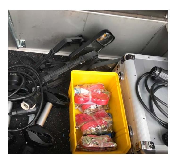
Valuable storage in the ground space