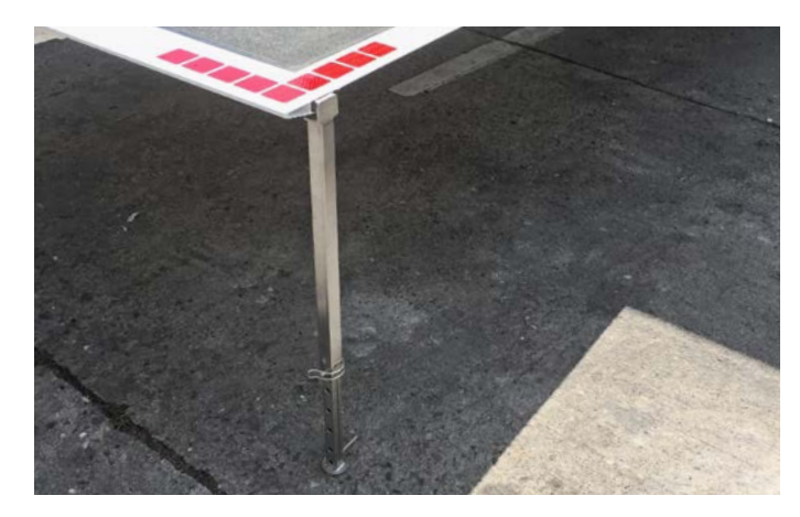
Additional benefits: seating area or sideboard with feet