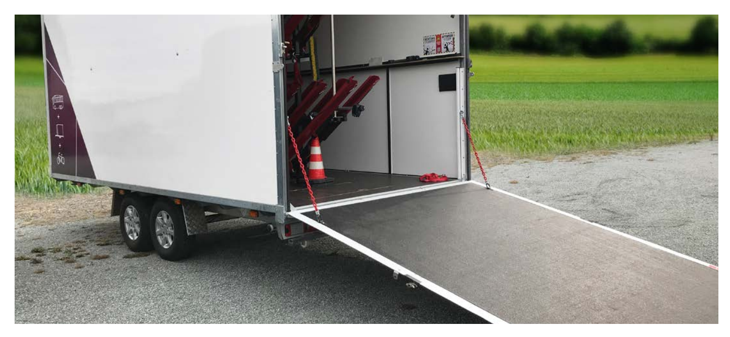
Anti-skid protection even when wet - for safe loading