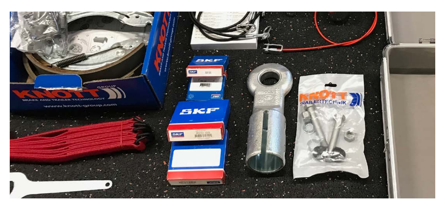
Spare parts set for emergencies with the most important components and wear parts