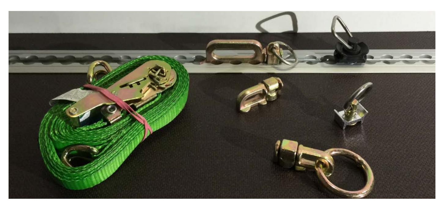
Secure your cargo BAG compliant with the innovative airline rails