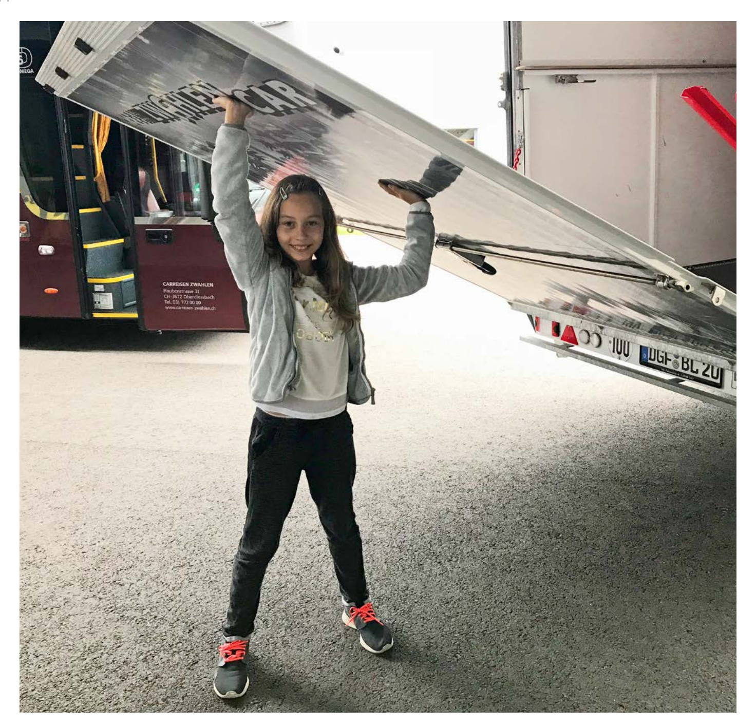
Easy to open rear ramp